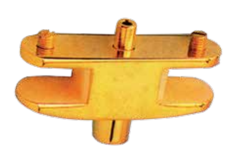
4000-13 Center Glass Support Base