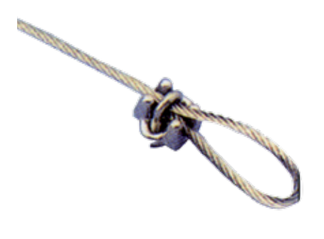
4000-20 Wire Fixed Base